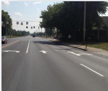
7 th Street & Davis Avenue Intersection