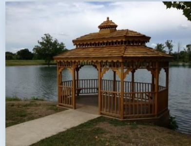
Gazebo Donated to Maple Avenue Park