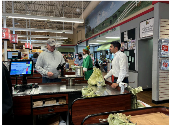
Mayor Sakbun participating in Celebrity Bagging at Baesler's Market on November 25.

Welcome to the monthly newsletter from The Office of the Mayor, curated by Mayor Sakbun himself. This newsletter highlights upcoming city events, street closures, ongoing city project updates, public safety information, and whatever else the Mayor thinks you, the citizens, should be informed of this month.