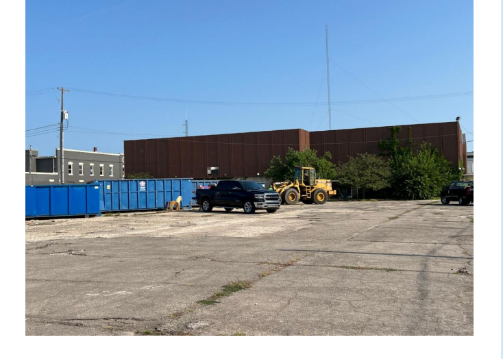
The Large Item Round-Up filled up all 5 of our dumpsters. Way to go Terre Haute! Look out for information on our City-Wide Fall Clean-Up soon!

Volunteers and employees helped dispose of large items, clean our curbs/inlets, and remove graffiti. Remember to use the 311 system when you set items or limbs out for pick up. We noticed a lot of items were not reported and simply dumped. It is unacceptable to dump large items and trash in our city. Let's keep working together to clean up Terre Haute!