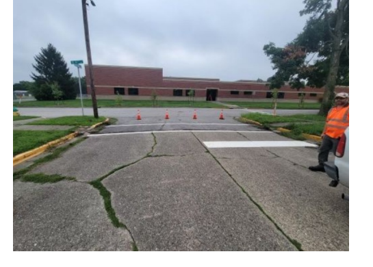
The new school year is just around the corner!