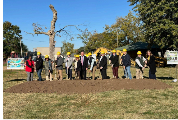
Herz-Rose Park Groundbreaking on October 21 .